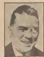
Floyd Gibbons Famous Radio Broadcaster

IT ISN'T necessary to be a "star" to make good money in Broadcasting. There are hundreds of people in Broadcasting work who are practically unknown—yet they easily make $3,000 to $5,000 a year, while, of course, the "stars" often make $25,000 to $50,000 a year.